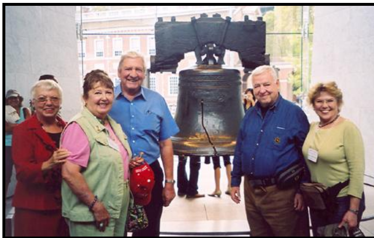
At Liberty Bell, Philadelphia