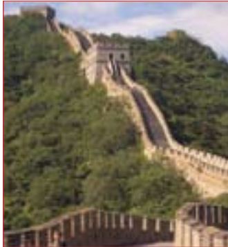
China Policy Seminar