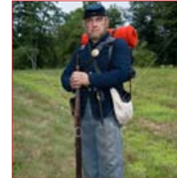
Civil War South